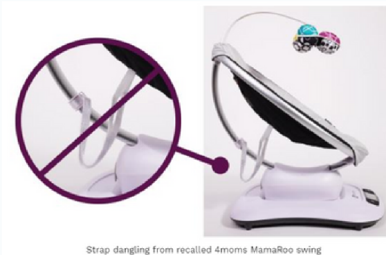
Strap dangling from recalled 4moms MamaRoo swing